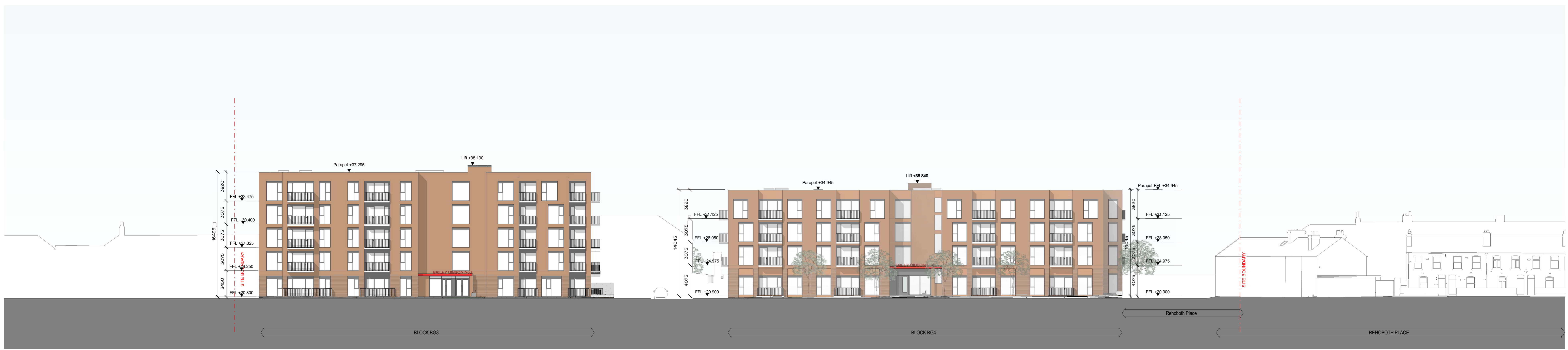
1 Contiguous Elevation 07 BG3-BG4 1 : 200