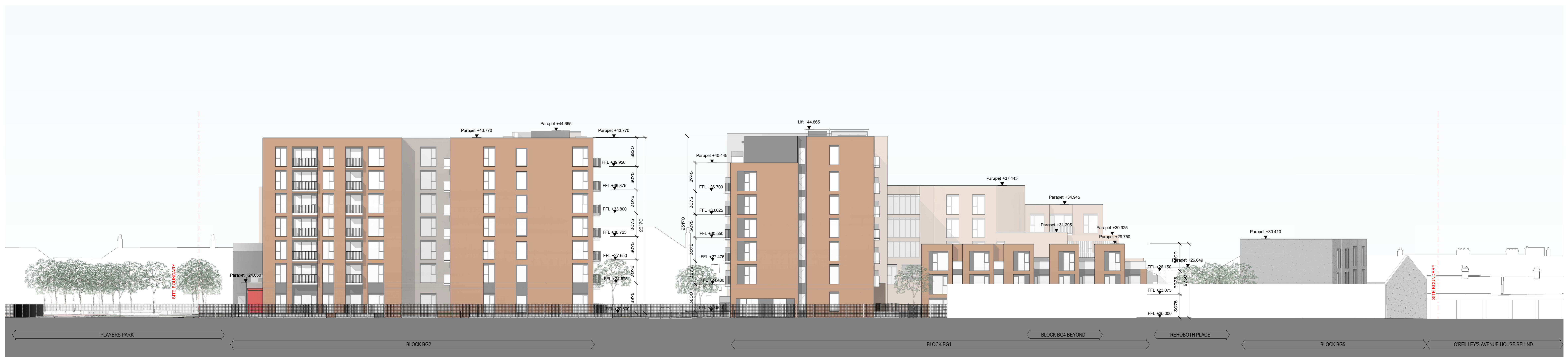
2 Contiguous Elevation 08 BG1-BG2-BG5 1 : 200